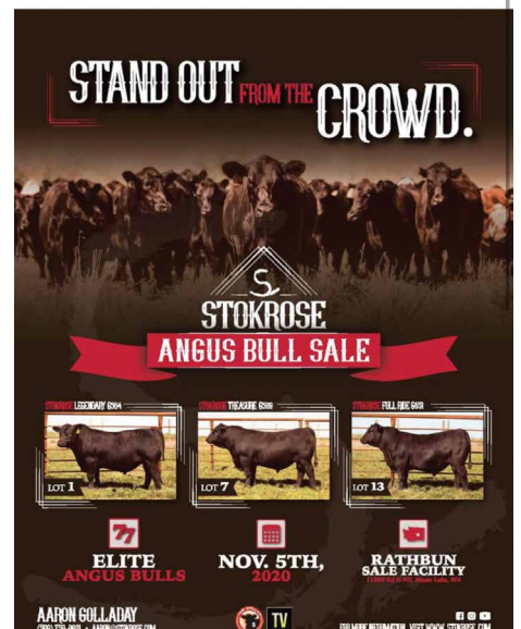
Example of Facebook Ad